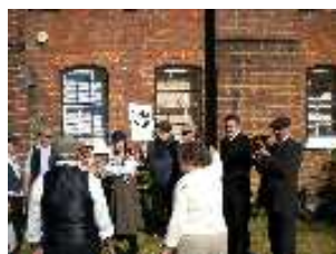
Rowdy Crowd Scene